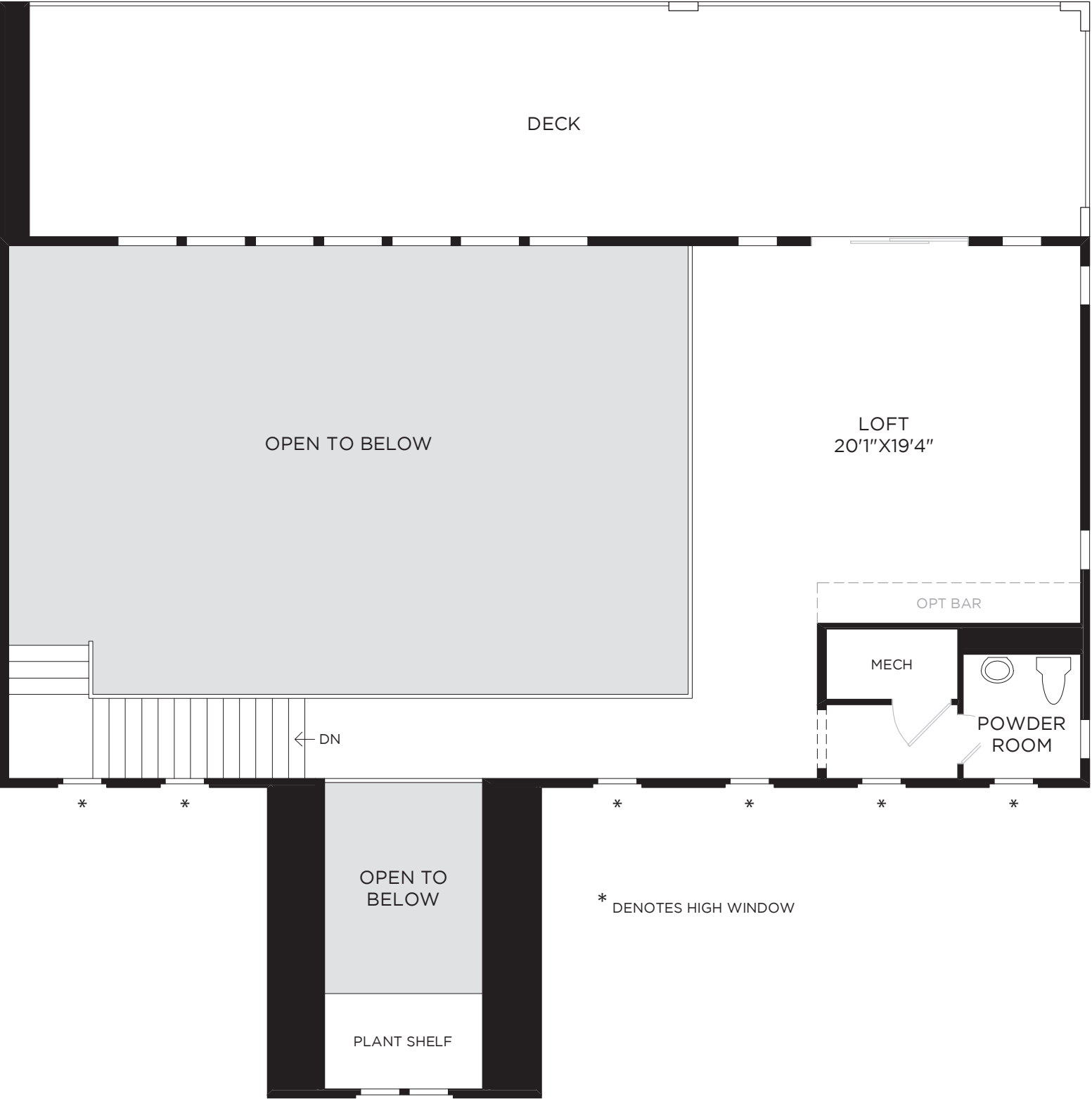
Second Floor 9' CEILING HEIGHT